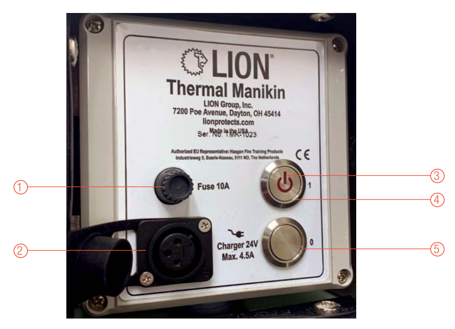
FIGURE 4: OPERATING PANEL "THERMAL MANIKIN"

Press the "OFF" button (5). The Warming up LED (3) turns off and the manikin stops warming up.